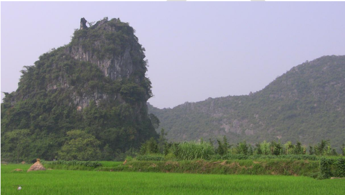
Figure 1. Ecological engineering research site located at Lingui near Guilin, Guangxi Province, China (GM Gurr, 8 th September 2009).

Prof Gurr travelled to the ecological engineering research site located at Lingui near Guilin, Guangxi Province, China on 8 th September 2009 accompanied by Prof Cheng (Zhejiang University) and staff of the Guangxi Provincial Station of Plant Protection. Ecological engineering had been established on a relatively small area of approximately 6.5ha with an additional ca. 3.5ha nearby identified as a control area. Approximately 25 farmer families were participating. Rice was in an early-medium stage of vegetative growth (Figure 1).