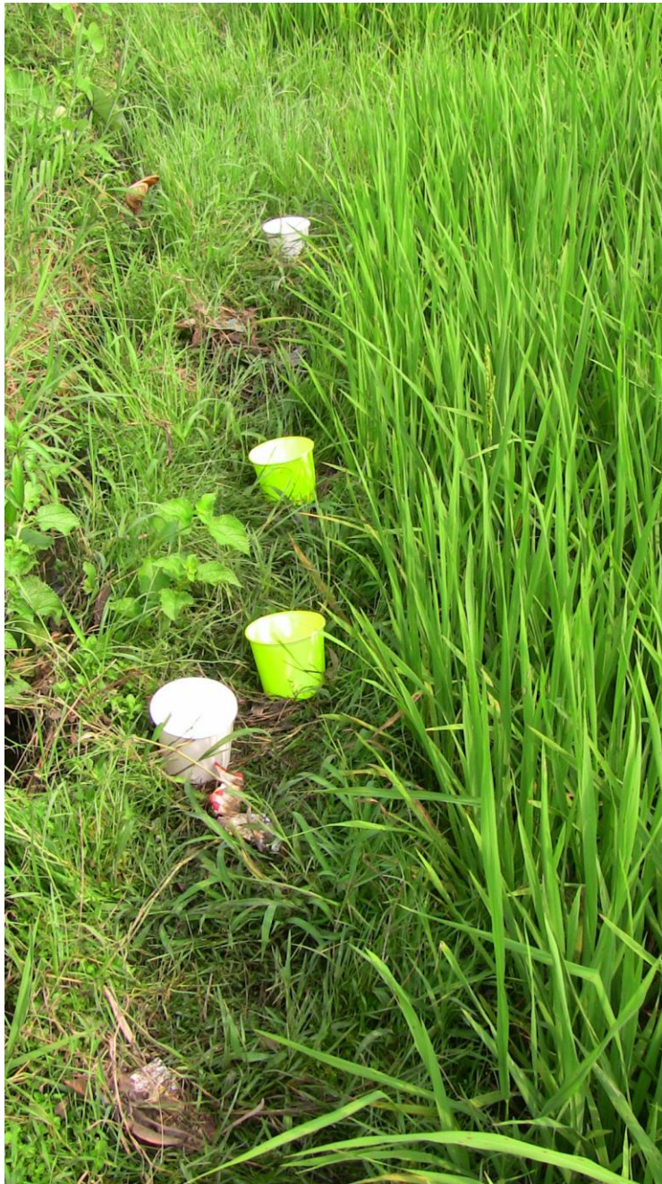
Figure 3. Yellow and white water pan traps for parasitoid trapping on bund at ecological engineering research site located at Lingui near Guilin, Guangxi Province, China (GM Gurr, 8 th September 2009).

On 10-11 September Professor Gurr attended the International Workshop on Insect Pheromones for Monitoring and Controlling Key Agricultural Insect Pests . On the first day he delivered an overview of recent work on chemical ecology-based approaches for