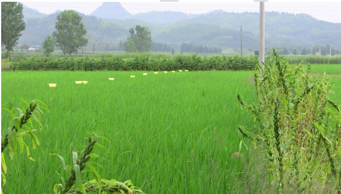
Figure 6. Yellow water pan traps for parasitoid sampling from rice at research site near Jinhua, Zhejiang Province, China (13 September 2009).

Further discussion will need to take place at the review meeting in Vietnam in December 2009 to refine the fine detail of methods. This should extend over issues such as the mesh size of sweep net fabric and specifications of the vacuum sampler. The Sampling Protocol Document ( http://ricehopper.files.wordpress.com/2009/07/sampling-protocol-27-july-2009.pdf ) will then need to be updated with appropriate detail.