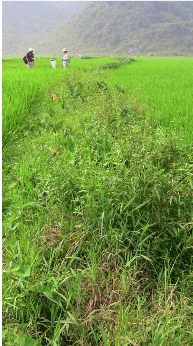
Figure 2. Bund with self-sown dicotyledonous weeds (foreground) and soybean (background) on ecological engineering research site located at Lingui near Guilin, Guangxi Province, China.

Sampling had been implanted. Water pan trapping, sweep netting and pitfall trapping was reportedly conducted on 18 August and sticky boards were placed out on 1 September. Hills were also being monitored for pests and light traps were also in place.