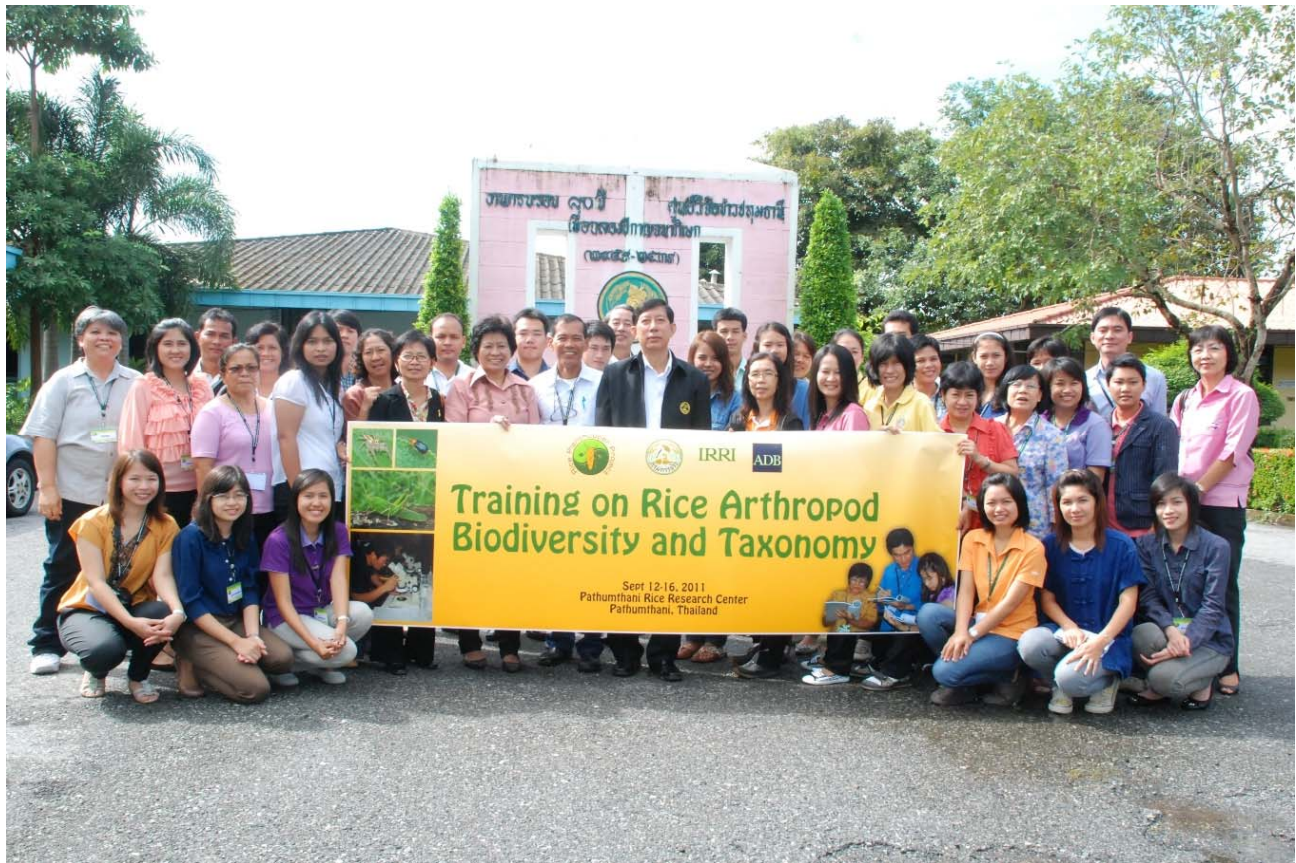
Figure 2. Participants in the 4 th arthropod biodiversity training course held at Pathumthani Rice Research Institute, Pathumthani, Thailand on September 12-16, 2011.